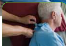
Zips have end-protection to help prevent inappropriate disrobing