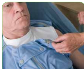
Can be supplied with 'Close-up' Fastener